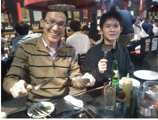
Monja-Yaki @ Tsukishima